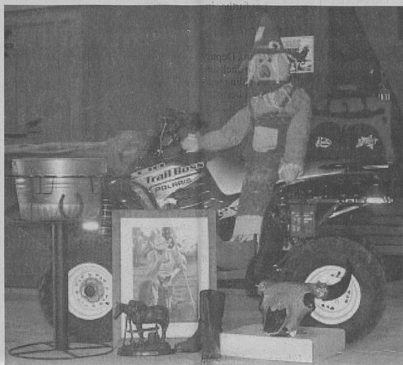
Auction items donated to the CCAA Backwards Draw shown above are a Polaris 330 Trail Boss 4-Wheeler by Potter Tractor, Horseshoe Party Bucket by Legacy Building Systems, Western Art Print by Bonnie Richey, Blue Gem Turquoise Buffalo Head by Doug Babbitt, Horse Statue and Justin bag by Potters Western Store, Ostrich Boots by Cavenders and custom boots by Ganica Boot Shop.

A couple of the first projects sponsored by the CCAA were at the Colo-